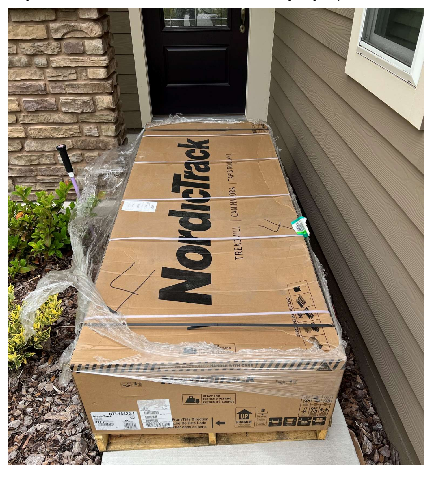
Bought a NordicTrack EXP 14i, assembled it, and have been using it regularly.